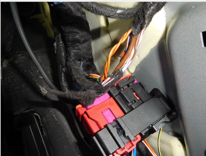
CAN wiring at the front right door harness