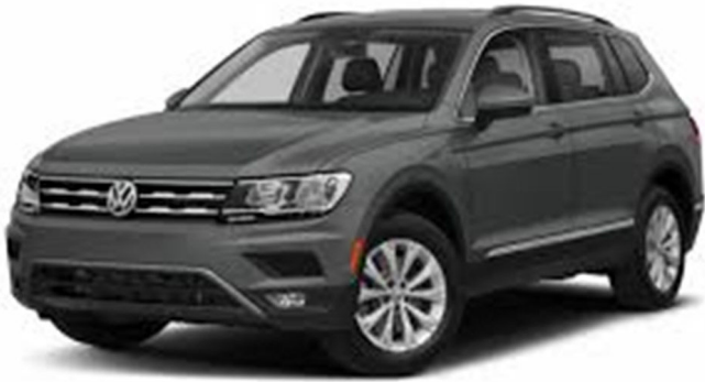
VW Tiguan 2017 -