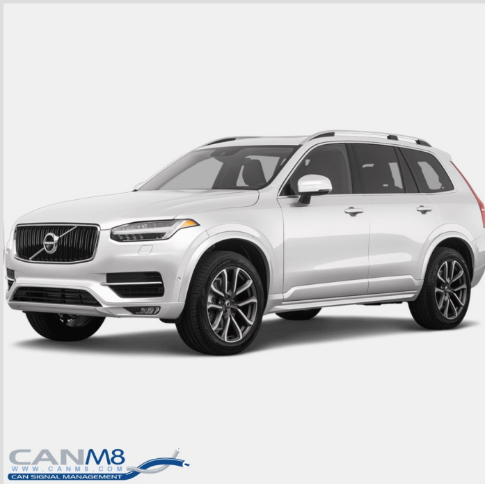
Volvo XC90 2019 -