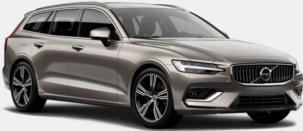
Volvo V60 2019 -