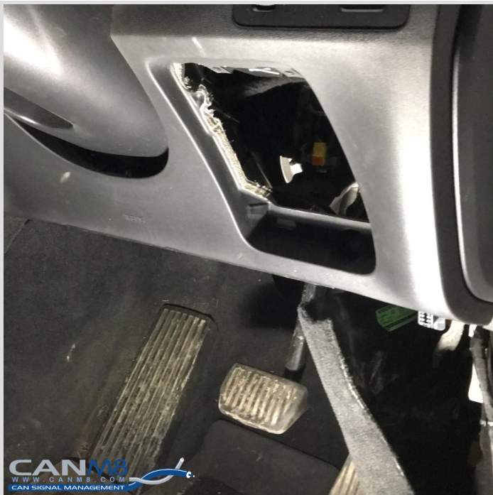
Drivers's side dash pocket removed