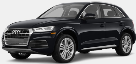
Audi Q5 2018 -