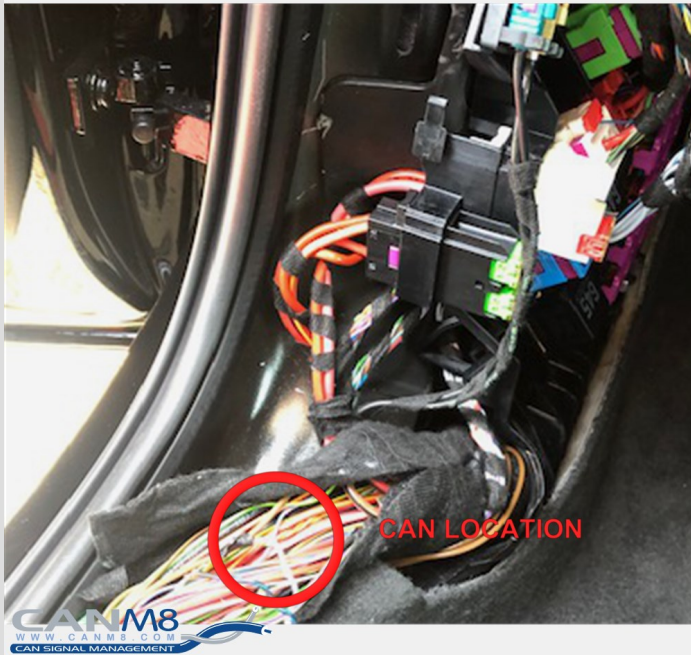
Main harness under the left side sill trim