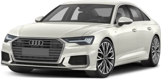
Audi A6 2018 -