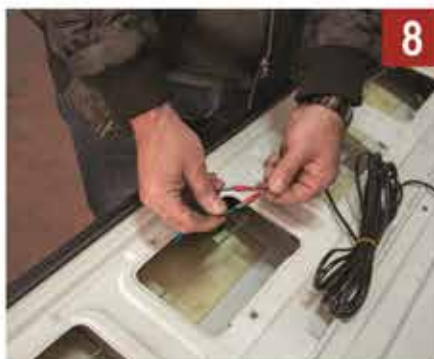
8 COMBINE THE CABLE FUEL FLAP CABLE