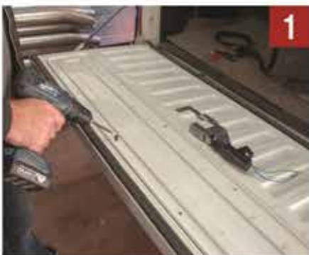
1 OPEN UPPER CAPS OF TRUNK

VW AMAROK 2012- CENTRAL TRUNK DOOR LOCK SYSTEM 7535BMK001