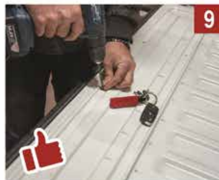
9 CLOSE THE TRUNK LOCK UPPER CAP AFTER CONTROLLING THE CAP LOCK BY YOUR REMOTE CONTROL