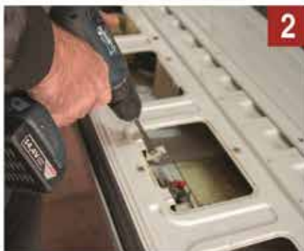
2 OPEN CLIPS