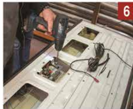
6 SET THE MECHANISM LIKE IN THE PICTURE