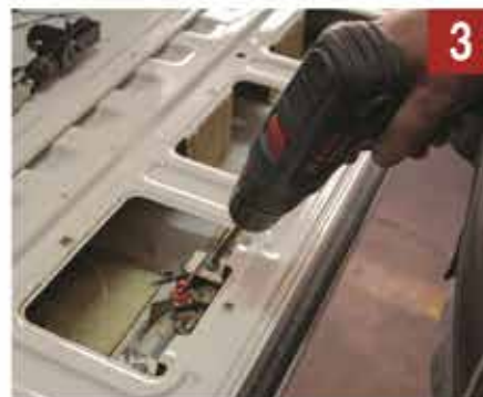
3 REMOVE LOCK SCREWS