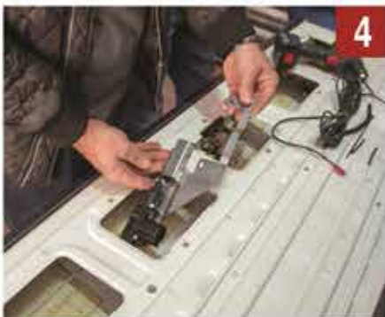
4 SET THE MECHANISM LIKE IN THE PICTURE